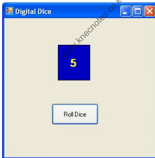
Figure 22.3: Animated Dice

Running the program produces a dice with fast changing numbers which stop at a certain number. The interface is shown below: